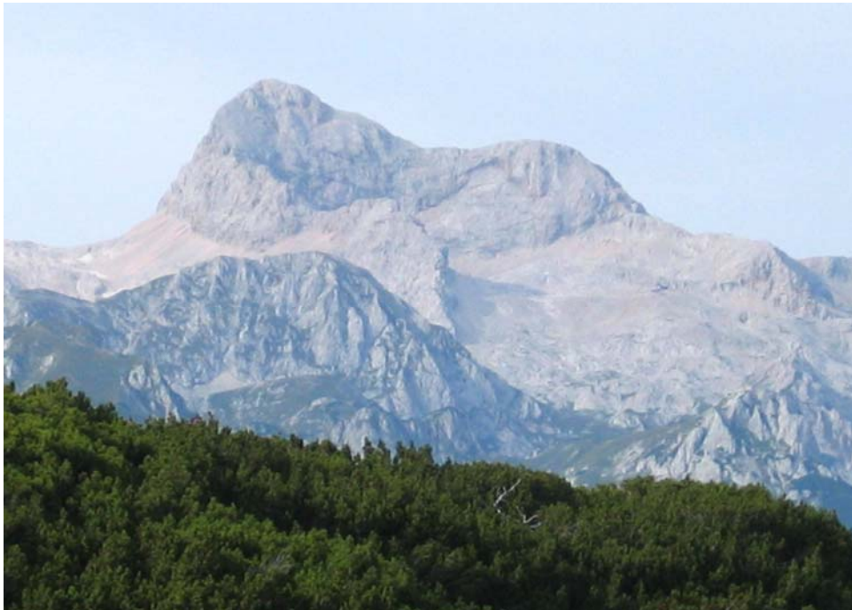
Assessing our foe before we climb...